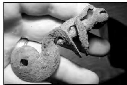
Flintlock musket hammer.