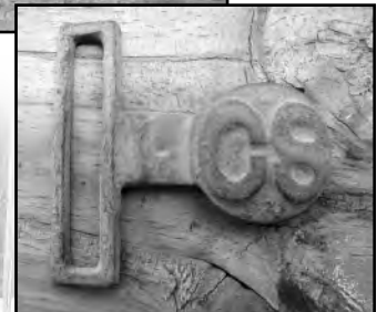
Confederated Civil War Buttons and Buckle found by Rob.