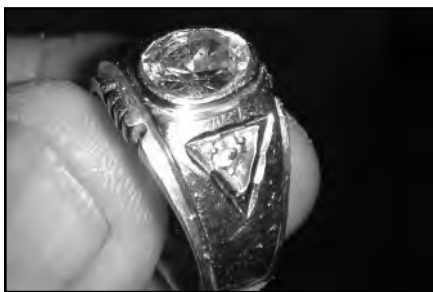
Men's gold and diamond ring.