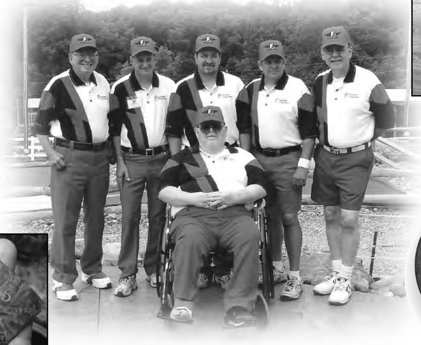
Red Legs Team along with other Fisher team members were - Treasure Week Competition Champions.