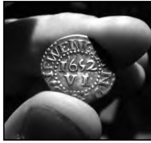
1652 Tree Coin.