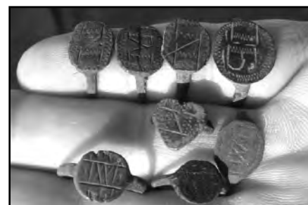
1700's Jesuit rings.