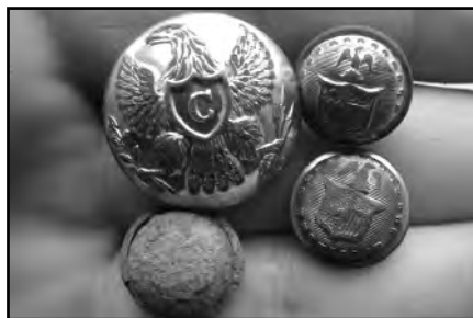
Civil war buttons.