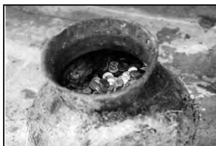
Milk can silver cache, found with a Gemini 3.