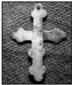
Silver fur trade era cross.